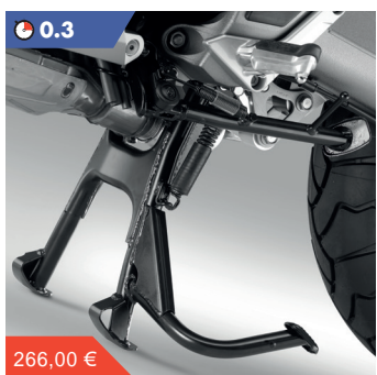
Mainstand 08M70-MGH-641 A necessity for more secure parking on variable ground surfaces, a Mainstand also facilitates cleaning and rear wheel maintenance.