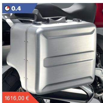
35L & 39L Pannier Kit (Alu) 08L70-MGH-N00 A set of two, direct fitting, Alu-look panniers designed to look fully integrated on the Crosstourer. The left pannier will hold most full-face helmets and they are lockable with the motorcycle key. Required Key Cylinder Inner Kit 08M70-MJE-D01 (25,00 €) for each pannier / Top Box.