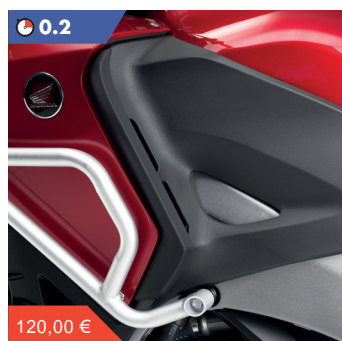
Fairing Deflector Set 08R70-MGH-640 A set of left and right black polyurethane deflectors that fit to the upper and lower fairing and extend the amount of wind protection for both rider and pillion.