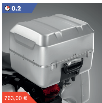
39L Top Box (Alu) 08L71-MGH-N00 An Alu-look Top Box offering 39L of carrying capacity to store one full-face helmet and more. Featuring a locking and easily detachable mounting system. Required Box Bracket 08Z70-MGH-640 (83,00 €) and Key Cylinder Inner kit.