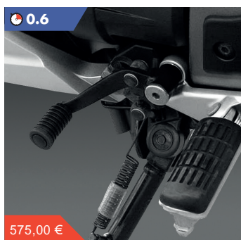
DCT Foot Shifter Kit 08U70-MGH-D21 A complete kit to select gears with a traditional foot shifter on the Crosstourer Dual Clutch Transmission model.