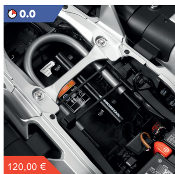
U-Lock 08M53-MEE-800 Keep your Crosstourer safe with this tamper-resistant barrel key U-Lock that fits neatly under the seat.