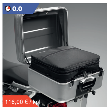
Pannier / Top Box Inner Bag 08L09-MGH-641 Carry your day to day necessities with this 21L black nylon bag with a silver Honda logo on the front. It fits into both the 29L Panniers or 39L Top Box and includes an adjustable shoulder strap and a carrying handle.