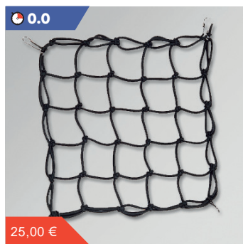
Cargo Net 08L63-KAZ-011 A black, flexible net to hold your luggage securely to the rear carrier and pillion seat.

Additional Accessories Further model accessories not shown are available: Heated Grip Kit Outdoor Cover Avento Alarm Kit Protective Film Optimate Battery Optimiser 12v DC Socket Kit